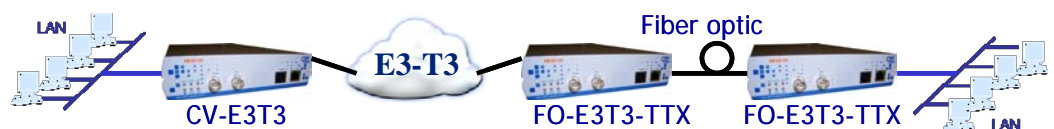
Ethernet interconnection over an E3 or T3 network

The CV-E3T3 transports an Ethernet traffic over an E3 or T3 link or network. The link is transparent to the Ethernet traffic and the upper protocols. Operation is very quick and easy. The peer end might be equipped with another CV-E3T3, but also with a couple of FO-E3T3 fibre optic modems if the E3/T3 network access point was far from the Ethernet network which would make some fault and / or cost increase with a coax cable.